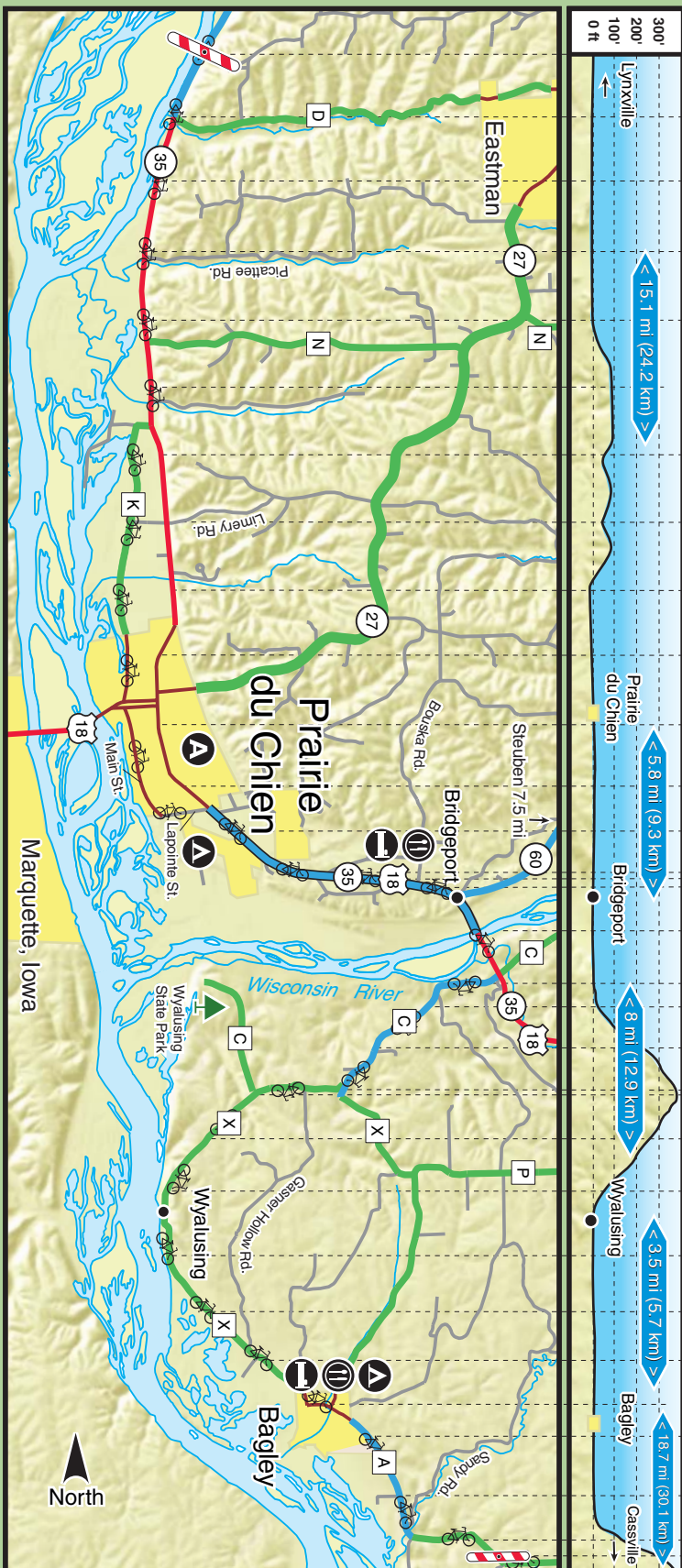
* Below is an elevation view of the route. Horizontal lines represent 100 feet in elevation change and correspond to the elevation of that point on the route. Vertical lines represent 1 mile distances along route.

Directions: Southbound. From map matchline south to intersection with County Highway K. Right on Highway K for 4.5 miles into Prairie du Chien. Highway K becomes Main Street. Main Street through town to Lapointe St. Left on Lapointe for 10 blocks. Right on STH 35/18 and continue to Bridgeport for 4 miles and across the Wisconsin River bridge. Just across the bridge turn right or southwest on County Highway C. Continue on Highway C until the intersection with County Highway X. Right on X. (Note: Highways X and C run concurrently for just over a mile, but remain on Highway X for 6 miles to Bagley.) Northbound. From Bagley travel on County Highway X. Intersect with County Highway C. Turn right on Highway C (Note: Highways X and C run concurrently for just over a mile). Stay on Highway C for 4 miles until the intersection with STH 35/18. Left on STH 35/18 and across the Wisconsin River Bridge. Remain on STH 35/18 to Prairie du Chien. Turn left on Lapointe St. for 10 blocks. Turn right on Main Street (will become County Highway K). Continue on County Highway K for 4.5 miles. Turn left (north) on STH 35. Continue for 7 miles to map matchline.